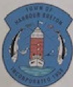
Georgina Ollerhead Mayor

I encourage all citizens to join me in underlining the importance of social connection for mental health.